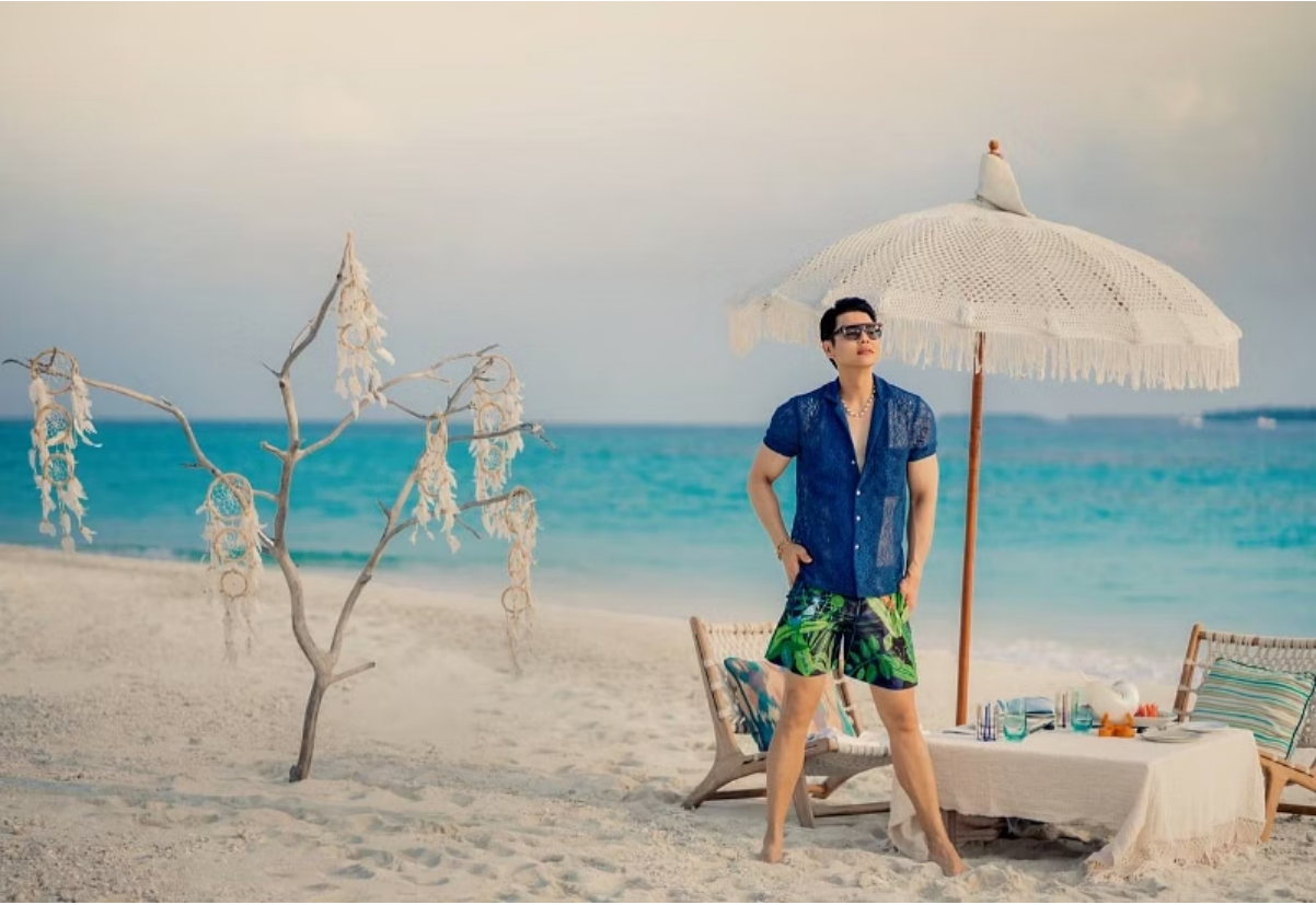
Get a picture-perfect picnic at The Nautilus Maldives.