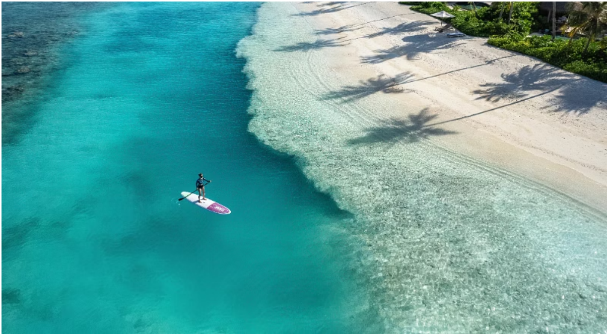
Take part in some stunning aquatic activities courtesy of the resort.

There’s also a private island a mere three minutes away by boat that’s being developed into an ecological playground. I visited this tiny 5.4-hectare island called Madhidrivaadhoo, and marvelled at its wildlife sanctuary where flocks of near-extinct birds grow and flourish. Greenhouses are being built to cater to a “farm-to-table” experience for guests, while the natural lake in the middle of the island is being developed into a picturesque landscape for honeymooners and weddings. Daytime sojourns can soon be spent here, but for now, you can play a game at the makeshift beach volleyball court, have a go at the couples swing, or just take a stroll through the natural jungle.