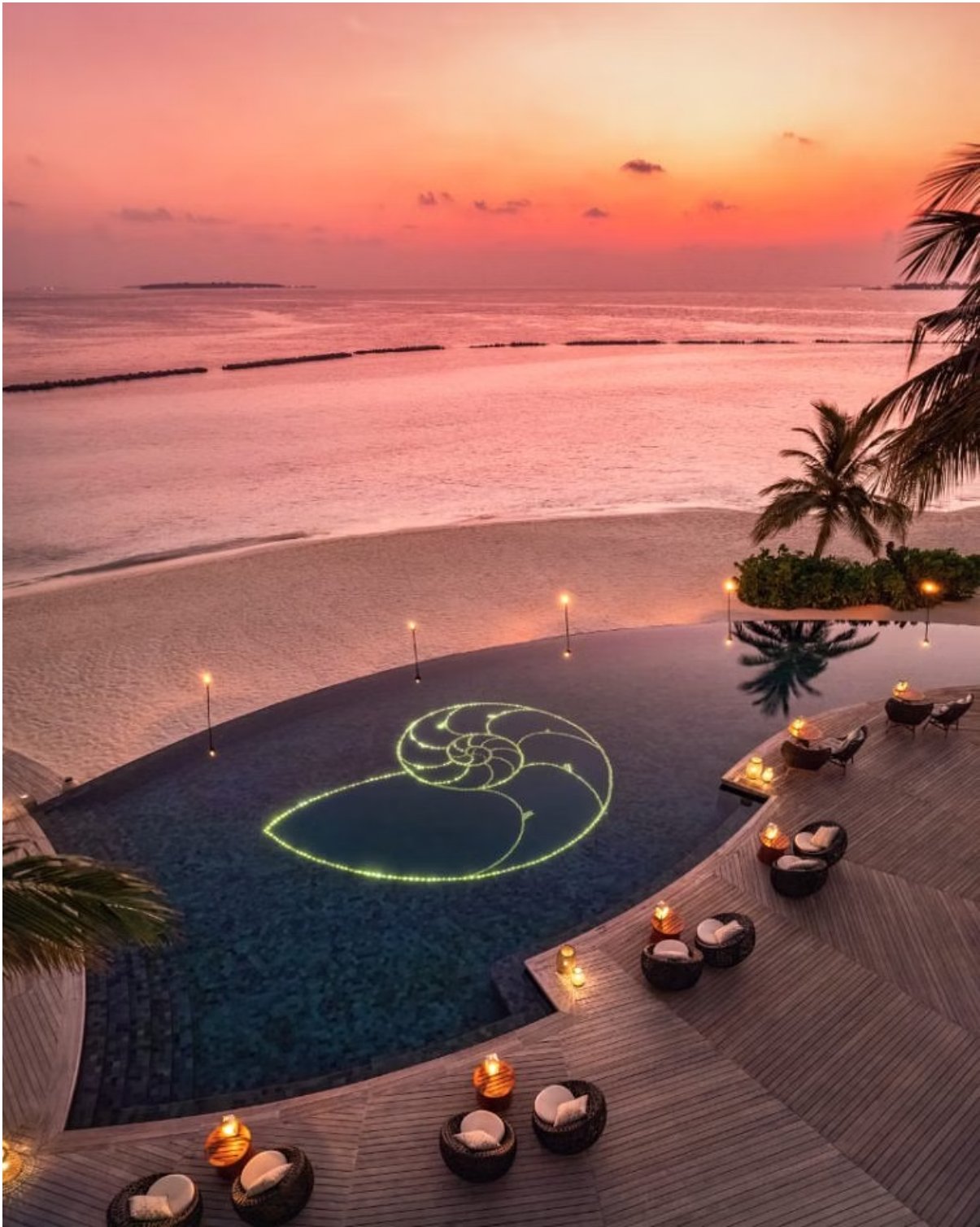
Poolside sunset at The Nautilus Maldives.

We all visit the Maldives because of the incredible ocean and sea life. But the reality is the elements and the environment in the Maldives are disappearing fast. People forget just how powerful the currents and the weather can be in this Baa Atoll. Built in 2019, The Nautilus was initially completely unprotected from the seas, which lent itself a stunning uninterrupted vista of turquoise-blue waters as far as the eye could see. But during the Covid lockdown in 2020, when the resort was shut for four months, fierce winds and raging currents swept most of the beach away. Wave breakers were built to shelter the island and the over-lagoon villas, as well as to protect the reef. Naysayers might complain that they spoil the grand sweeping views – but this necessary evil was the only form of protection from rising sea levels, increasing water temperatures and billowing winds. As with many island resorts in the Maldives, sustainable activations are needed to protect their aquatic wildlife.