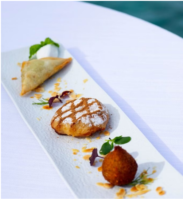
Take a bite of the Mediterranean at Zeytoun.