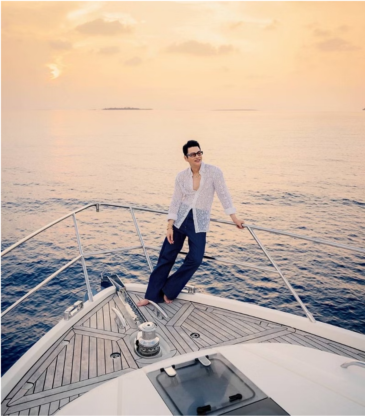
Don't forget to sneak in that photo shoot on one of your boat rides around the Baa Atoll.