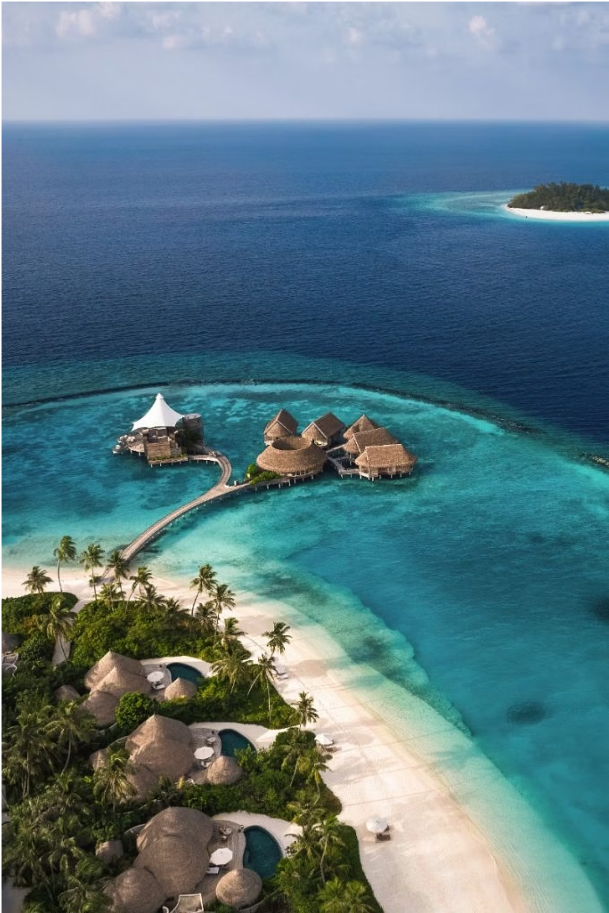
An aerial view of Zeytoun and the Solasta Spa.