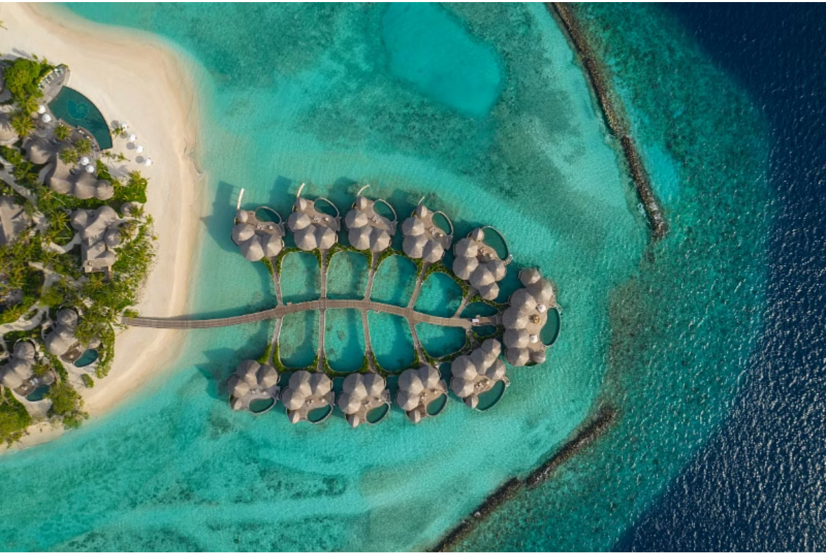
An aerial view of the resort and its crystal-clear surrounding waters.

But back to where it all started, which is the villa beach house that was home to me and my partner for the next five days. With our own private pool, immediate access to the beach and a separate living and sleeping space, it all adds up to 309 square metres across two thatched-roof villas. An outdoor shower is a perfect way to rinse off the day's snorkelling adventure before you're enveloped in aircon splendour when you step into the room. The design of the villa is best described as luxe boho – pastel shades clothe the sofas, cushions and carpet in pretty shades that Ariel from The Little Mermaid could only imagine. The massive king-size bed is all you need to laze the hot afternoons away; or you can pick one of three day loungers which are thoughtfully placed throughout the spaces – one in the living room, another at the foot of the bed and a large swing cabana by the pool for sunset drinks or a quick nap. Double basins are a must to keep couples happy, and the floor-to-ceiling glass windows allow