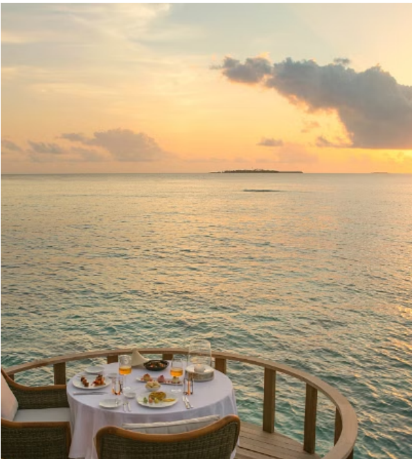
Have a romantic dinner right on the water, with unbeaten panoramic views of the sunset.