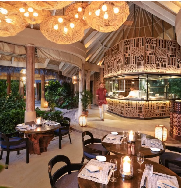
Indulge in exquisite Peruvian-Japanese cuisine under the romantic lights of Ocaso.

To you and me, that might seem completely topsy-turvy, but to The Nautilus, it’s all in a day’s work. Being a small and intimate resort allows you to interact with the staff and within two days, I was calling everyone by their first name – and we all engaged in happy banter about the ferocious afternoon sun and lack of rain. Guests got a chance to mingle by the Naiboli Poolside Bar at cocktail hour for complimentary drinks, and watch as the brilliant red sun sets before the twinkling stars take over the night sky.