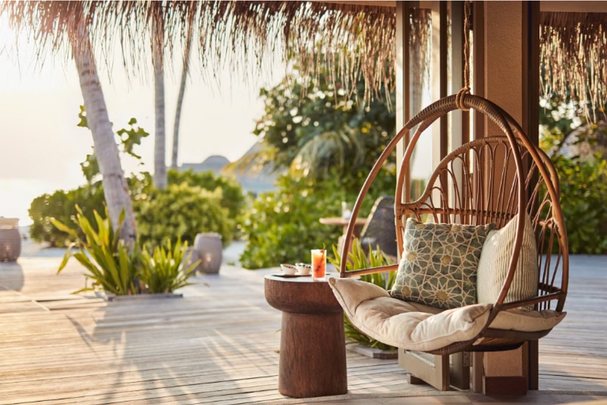
Enjoy a poolside drink in one of The Nautilus' cabanas.

Related article: These 12 Sandals Were Made For Walking All Summer Long